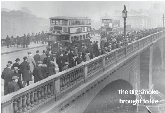
The Big Smoke, brought to life.

We are giving away three signed copies of White Knights . For details, see Shop Guide on page 151.